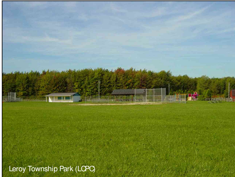
Leroy Township Park (LCPC)

The 1984 Township Comprehensive Plan raised concerns that expanding parkland in the township would decrease the tax base. Parks make up about 6.4% of all land in the township. Any expansion would be onto land zoned for low density residential use, which is assessed and taxed at a much lower rate than land zoned for commercial or industrial use. The relatively large amount of parkland and its impact on tax rolls is offset by the relatively small amount of other land uses not subject