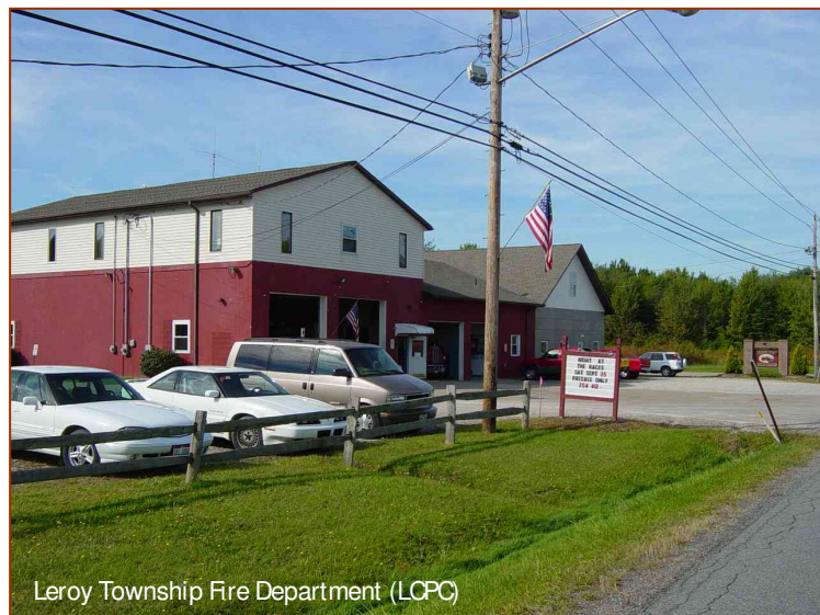
Leroy Township Fire Department (LCPC)

The Leroy Township Fire Department operates out of a station on Leroy Center Road, east of the Five Points Roundabout area in Leroy Township Park. Although it is technically a volunteer fire department, it employs both full-time and part-time firefighters to provide 24-hour protection to its residents. It is also the EMS provider for the township. The annual budget